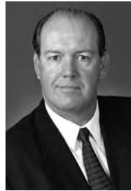
Senator the Hon David Johnston Since 9 March 2007