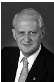
Attorney-General The Hon Philip Ruddock MP