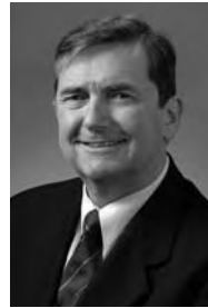
Senator the Hon Chris Ellison 1 July 2006 – 8 March 2007